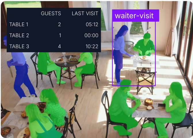
Vision AI helps high-end restaurant chains understand table occupancy and wait staff operations, improving the dining experience and profitability.

The new system significantly improved data capture and visibility, leading to more attentive waitstaff, fewer idle tables, shorter queue lines, and faster table turnover. The group can now better identify and address operational inefficiencies, consistently upholding their high hospitality standards.